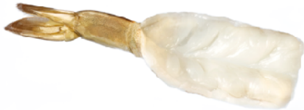
Tail on butterfly

This compact automatic shrimp peeling machine is designed for restaurants, seafood markets and other food service operations with limited floor space.