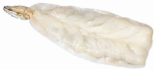
Completely peeled and deveined, split