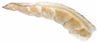
Completely peeled and deveined